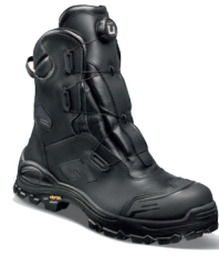
Brimir S3 SRC BRIMS30NR