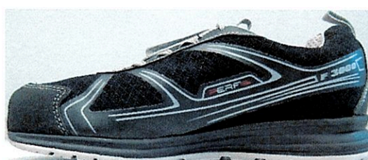
art Gravity Five