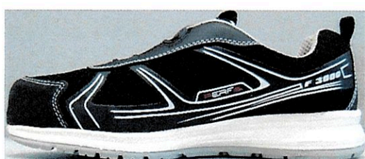
art Gravity Six