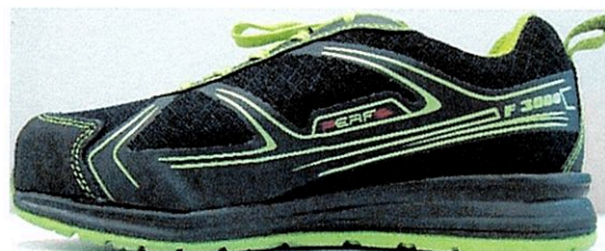
art Gravity Zero