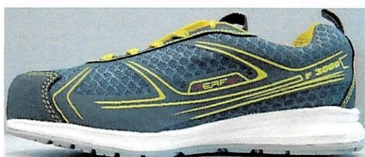
art Gravity Eleven