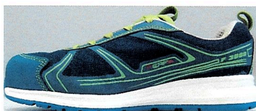
art Gravity One