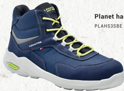
Planet haut bleu S3S PLAHS3SBE