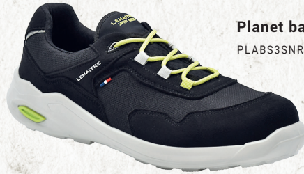
Planet bas noir S3S PLABS3SNR