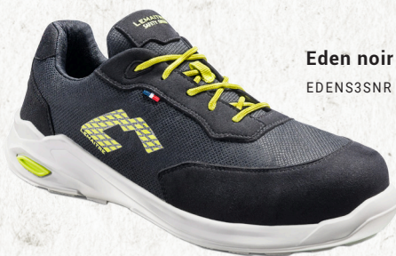
Eden noir S3S EDENS3SNR